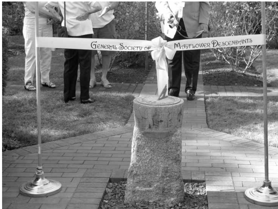
The Michigan Society brick in the Mayflower House/Library Garden Walkway